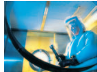
Superior chemical resistance and clarity