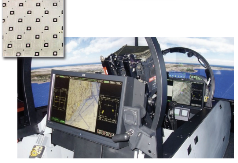
F15 with Large Area Display -LAD

Lens and Capsules are assempled in a predetermind matrix on a back plate which is covered with optical reflectors. The finished assembly is then subject to very aggressive vibration testing to ensure the lens and capsule construction is secure for extreme flight conditions.